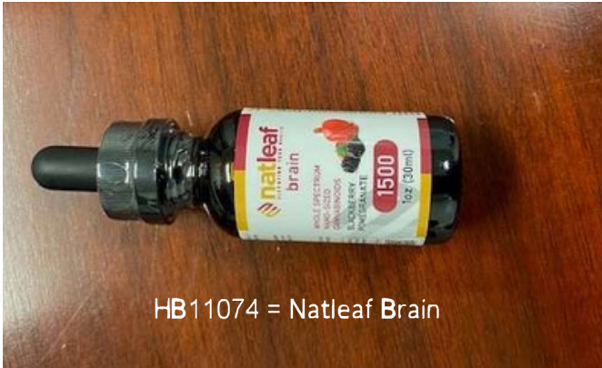
HB11074 = Natleaf Brain

Client INVENTED GREEN, LLC 7345 W SAND LAKE RD, STE 210 OFFICE 2318 ORLANDO, FL 32819 uS